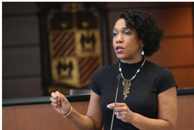
Julianna Stratton , Lieutenant Governor of the State of Illinois, spoke on Governor J.B. Pritzker's administration's vision for its Justice, Equity, and Opportunity Initiative.

Log on to LUC.edu/law/RodinCenter for information about future Rodin Symposia.